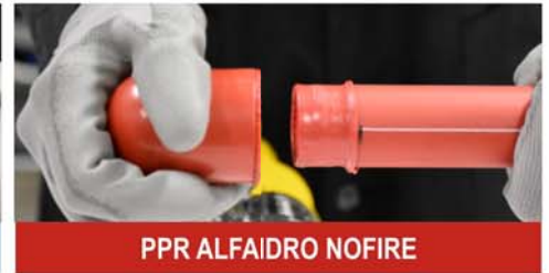
PPR ALFAIDRO NOFIRE